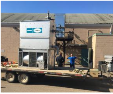
Our new condenser unit arrived Sept. 5

Take a look at some of our posts on social media from September and October.