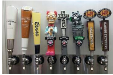
We announced our brews for the season on Oct. 2