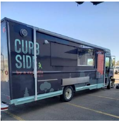
“Curbside was on-site in their awesome food truck during the WCT”